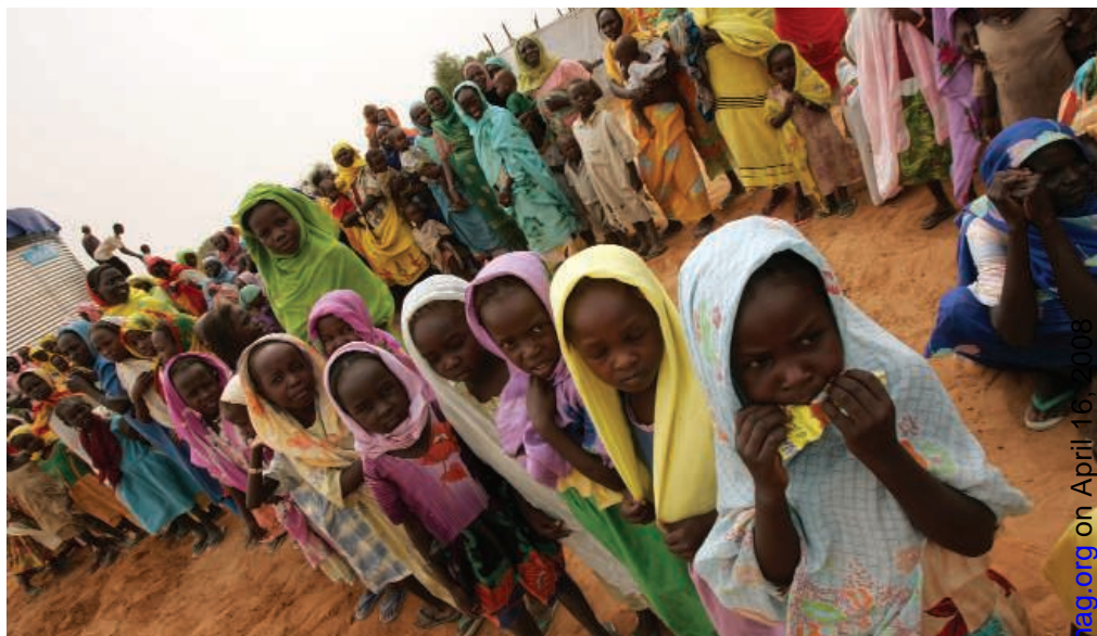
Disruption of family structures and loss of kinship boundaries make counting the dead more difficult. Refugees in an IDP camp school, Nyala, South Darfur, Sudan.

Analysis of factors confounding previous estimates leads to the conclusion that hundreds of thousand of people rather than tens of thousands have died as a result of the conflict in Darfur.